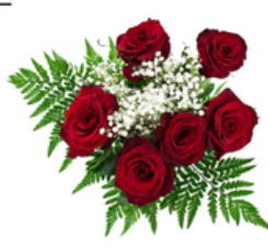
Large Rose Bouquet $20