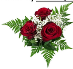
Small Rose Bouquet $12