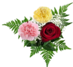
Small Assortment Bouquet $10